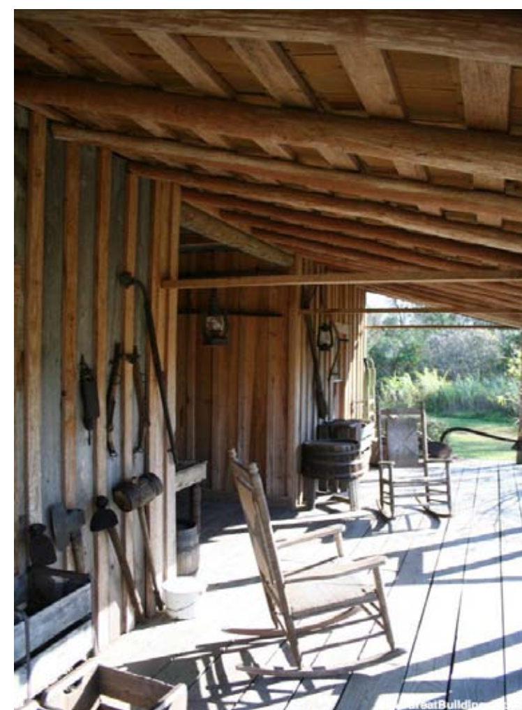
"DOG TROT" ARCHITECTURE IMAGERY